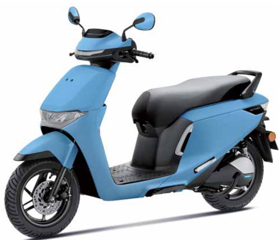
Pearl Serenity Blue