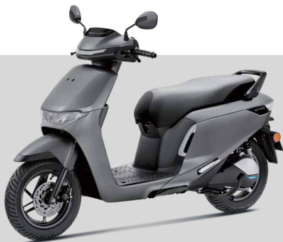
Matt Foggy Silver Metallic